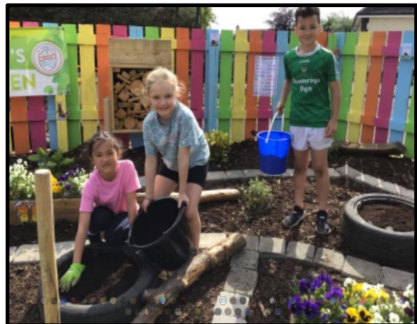
Planting in our Eco-Garden