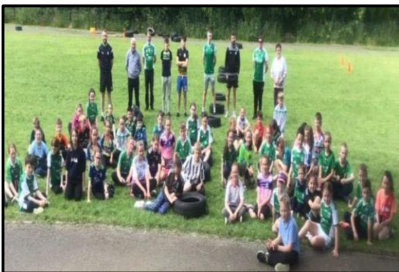
Roslea GFC Coaching Day

We see our school as a central part of the local community and we are proud of the strong links we have nurtured with local businesses, Roslea Shamrock's GFC, St. Tierney's Church, neighbouring primary and post primary schools and indeed the wider community. By working together to give our pupils the best opportunities and experiences, we enable them to grow and develop life skills and find their place as valuable members of society.