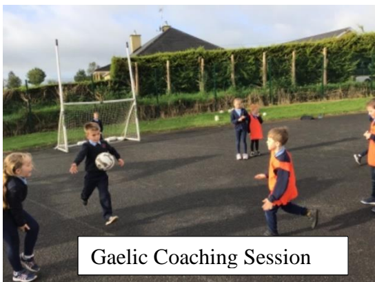
Gaelic Coaching Session