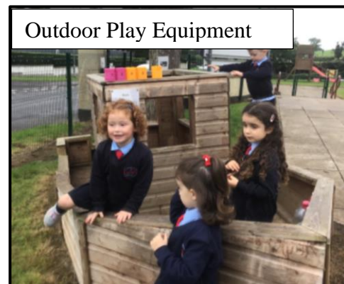
Outdoor Play Equipment