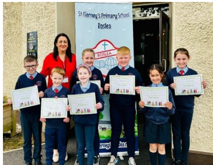
School Council for 23/24