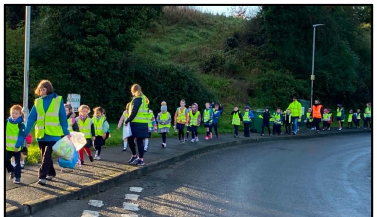
Sustrans Walk to School Week