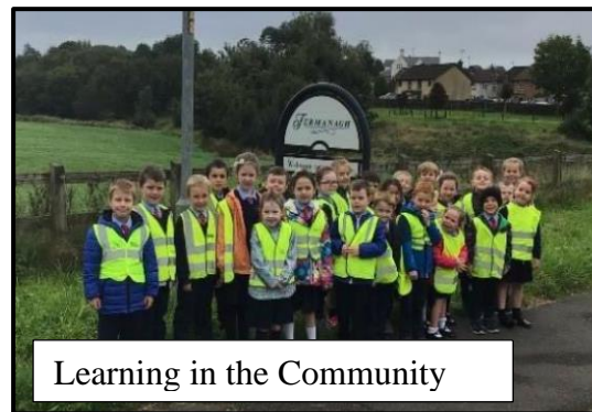
Learning in the Community