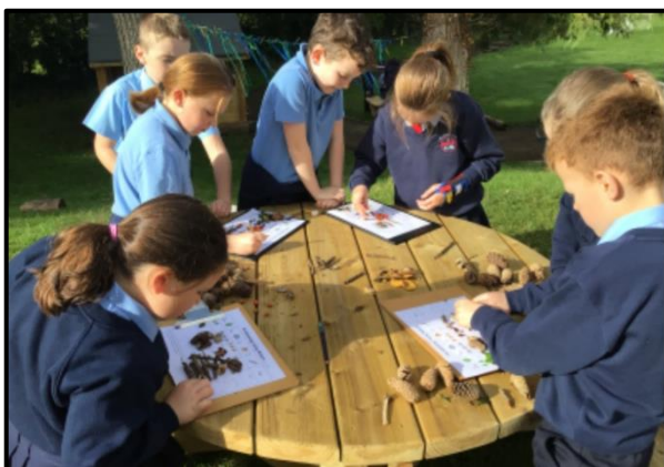
Outdoor Maths Problem Solving