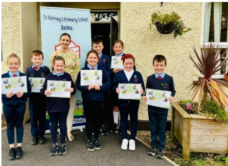
Eco Council for 23/24

By promoting the Voice of the Child we are happy that in our school we are helping to build confidence and prepare young people for roles in society.