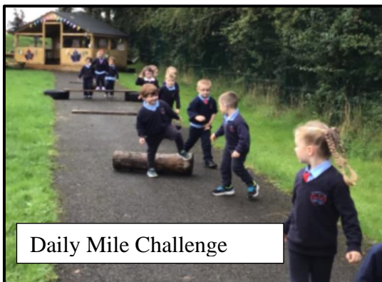
Daily Mile Challenge