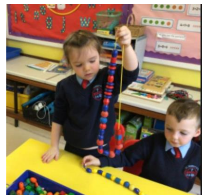
Active Learning in Numeracy