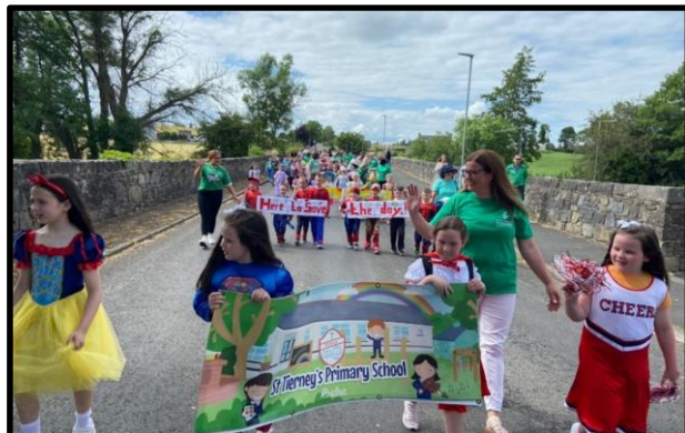
Leading the parade at Fermanagh Fleadh