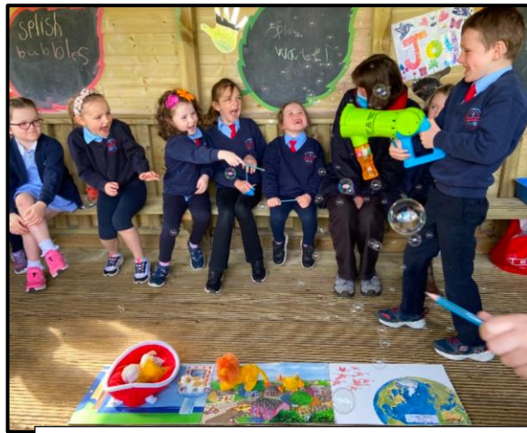
Story Time in our Outdoor Classroom

Pupils are offered a range of extra-curricular activities, either within the school day or after school through our popular Extended Schools Clubs. Activities on offer include; Gaelic football, camogie/hurling, tin whistle, fiddle, choir, art, games, drama, cooking, athletics, sports, ICT, cycling proficiency, gardening and much more.