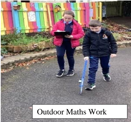
Outdoor Maths Work

Learning will be a source of pleasure; this can be achieved through work of a practical nature. Practical work includes Drama in Literacy, RE, PDMU etc; practical work and experiments in Numeracy, World Around Us and Activity Based Learning.