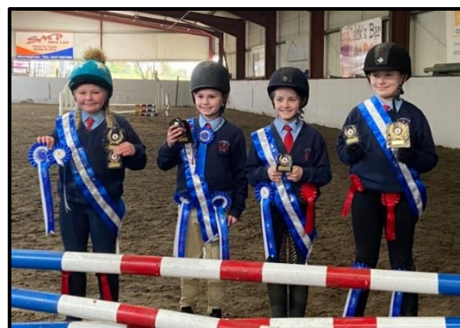
Mullaghmore Equestrian Schools League