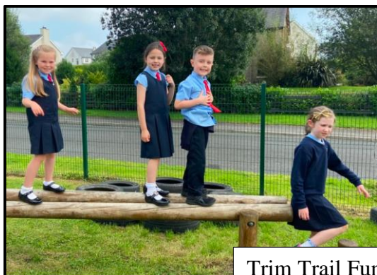
Trim Trail Fun and Agility Sessions