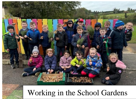
Working in the School Gardens