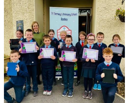
Digital Leaders for 23/24