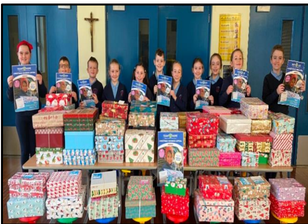
Team Hope Shoe Box Appeal

St. Tierney's Primary School has strong links with Roslea Cross Community Play Group and continues to develop a learning community with its neighbouring primary schools and post-primary schools and with the many groups and associations within the Roslea community and the surrounding areas. As a school community, we are committed to building relationships at all levels. This partnership consists of the Board of Governors, the staff, the pupils and parents all working together to ensure that our children receive the best education possible. The ethos of the school is experienced through the warm welcome given to all. All contributions are valued, whether from pupils, parents, staff, governors, external agencies or other stakeholders and we are committed to a process of self-evaluation to ensure we continue to improve on our previous best.